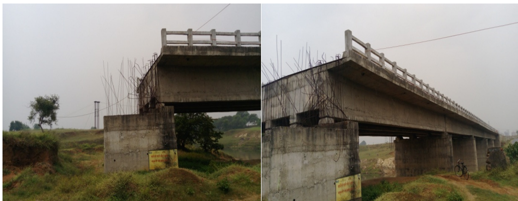
Photographs showing bridge over Sanjay river lying idle in absense of approach road

Thus, the land for the approach roads could not be acquired and the bridge could not be put to use for almost three years since its completion in August 2016 rendering the expenditure of ₹ 7.36 crore incurred on the bridge work idle besides non-achievement of the objective to ensure safe and smooth movement of traffic throughout the year.